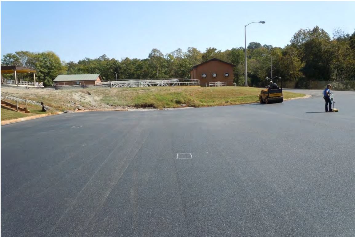
North Side Paving near Solids Handling Facility