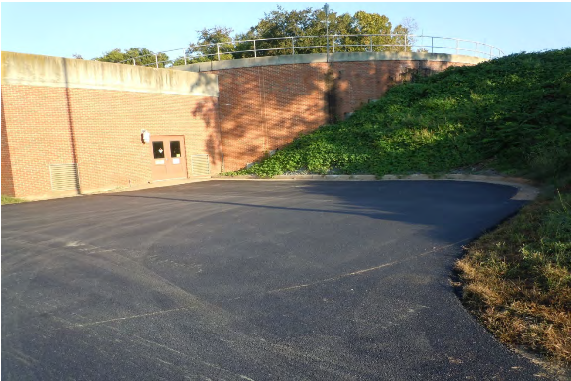
North Side Paving near Digester Complex