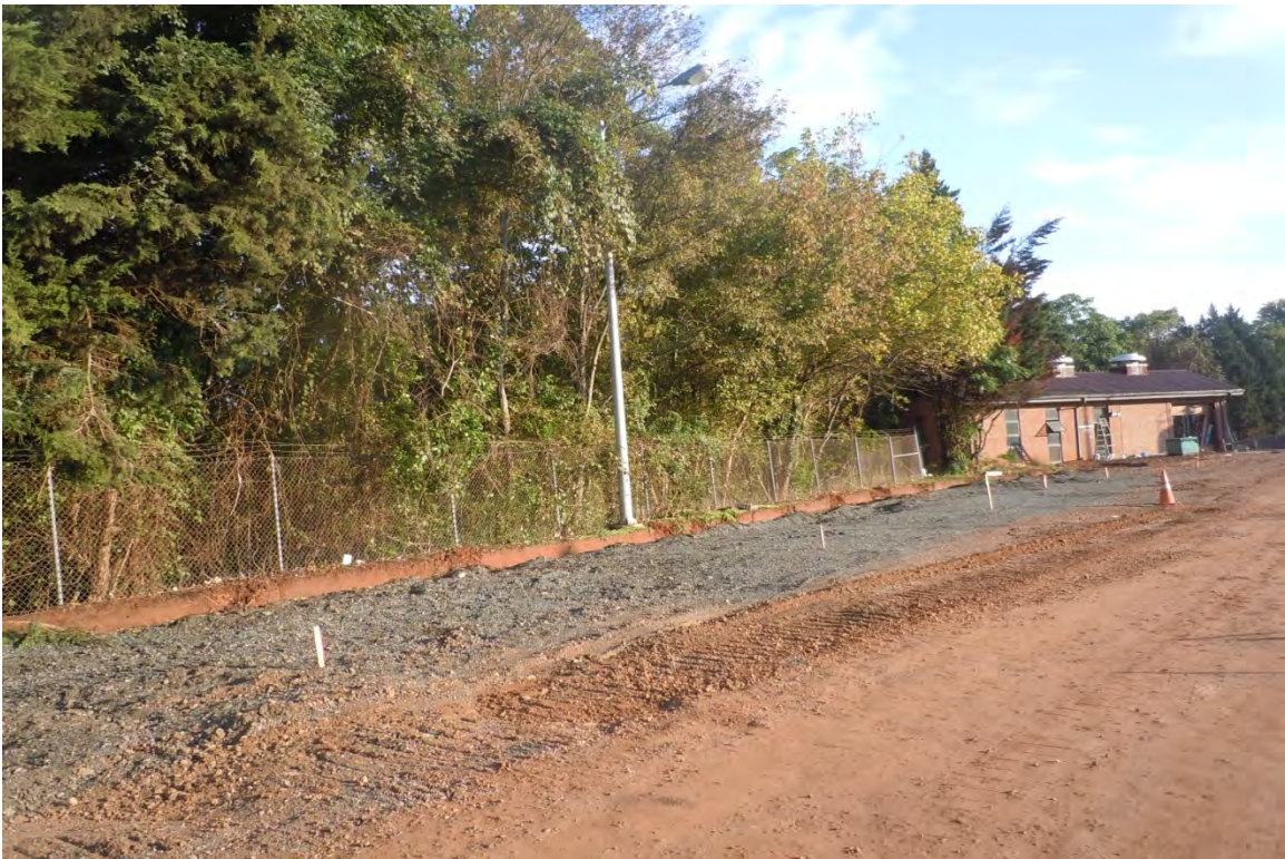
Grading and Stakeout for New Stormwater and Curb in the Maintenance Yard