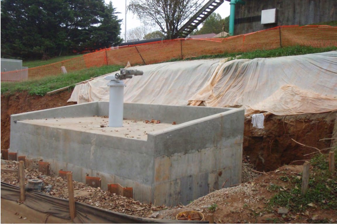
Holding Pond Line Flow – Metering Vault