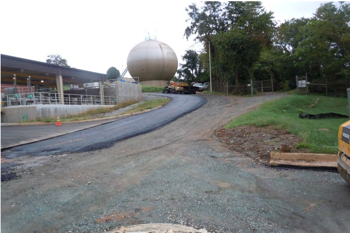
North Side Paving near the UV Facility