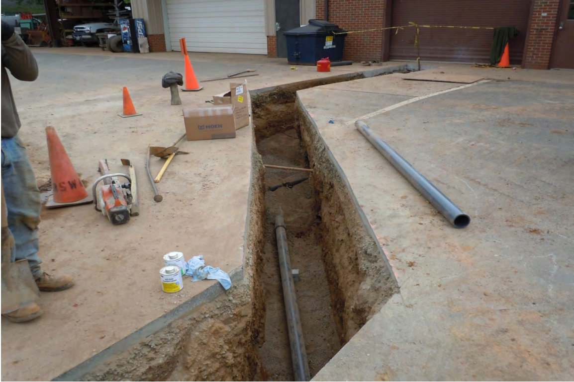
New Maintenance Building Drain Trench Installation