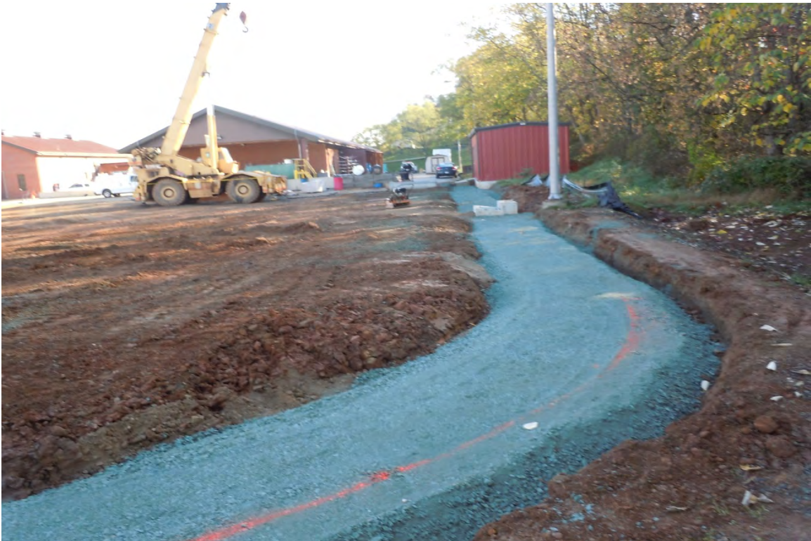
Subgrade for Curb near Secondary Clarifier No. 4