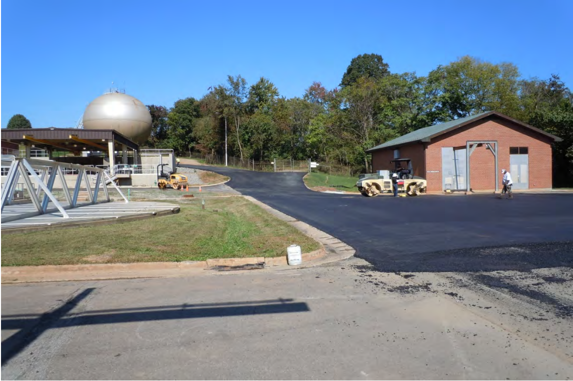
North Side Paving near the UV Facility and Backwash Tanks