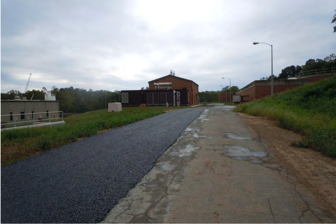
North Side Paving near Boiler and Filter Facilities