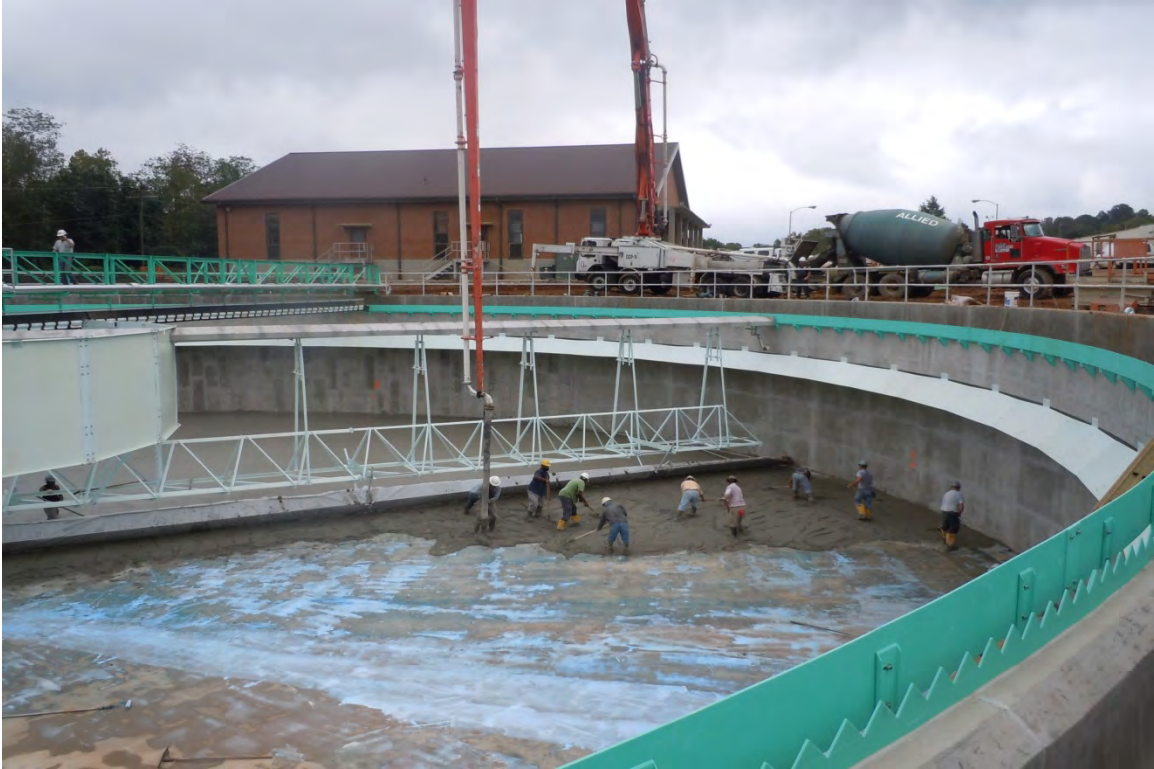
Secondary Clarifier No. 3 – Placement of Grout Floor