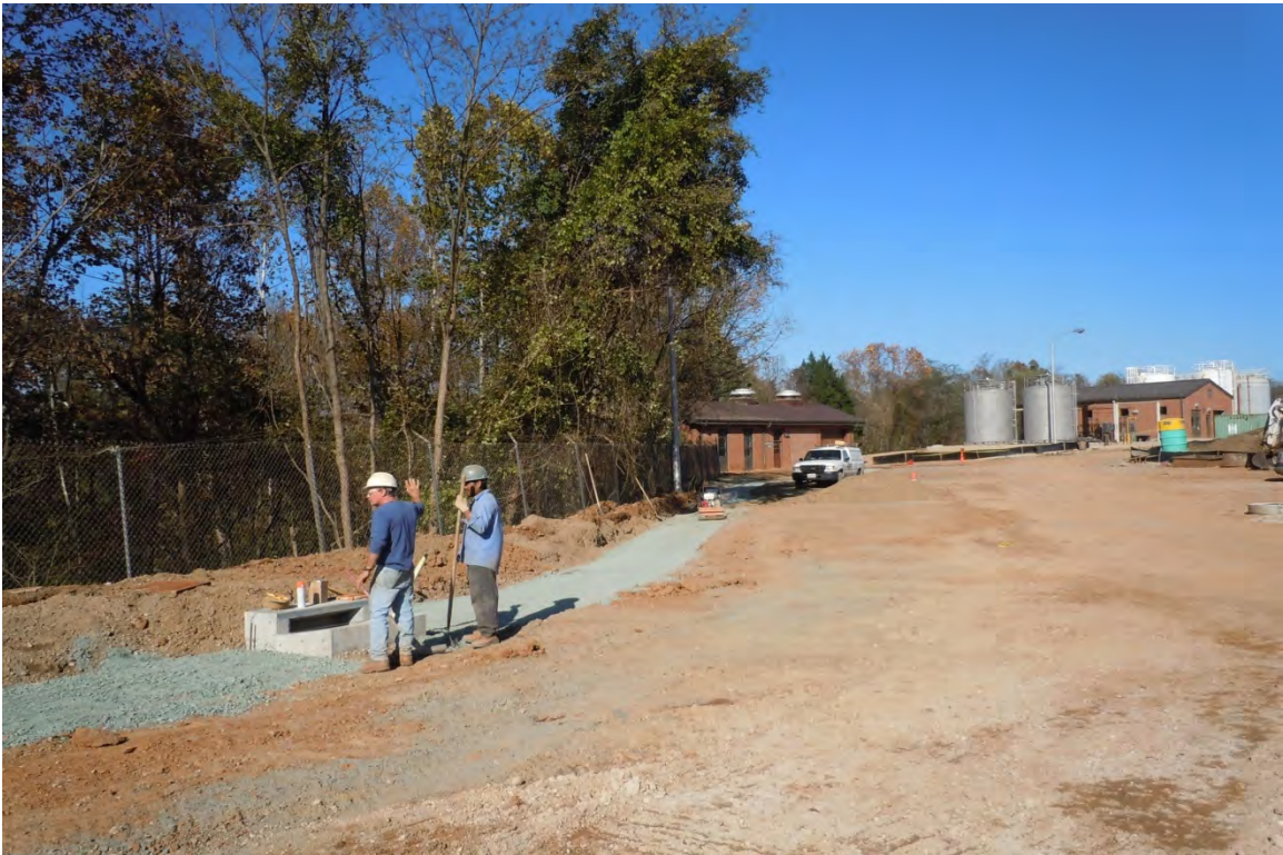
Stormwater Installation – Maintenance Yard