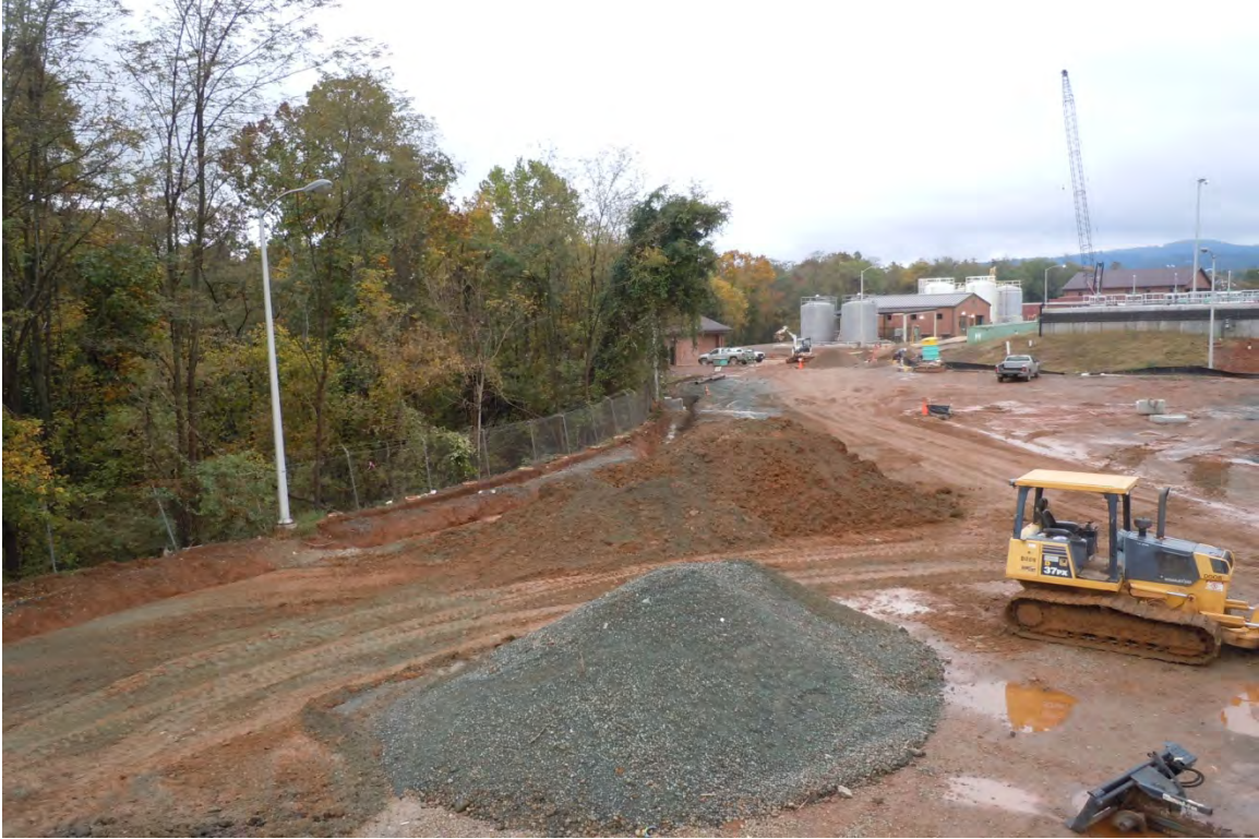
Stormwater Piping Installation – Maintenance Yard