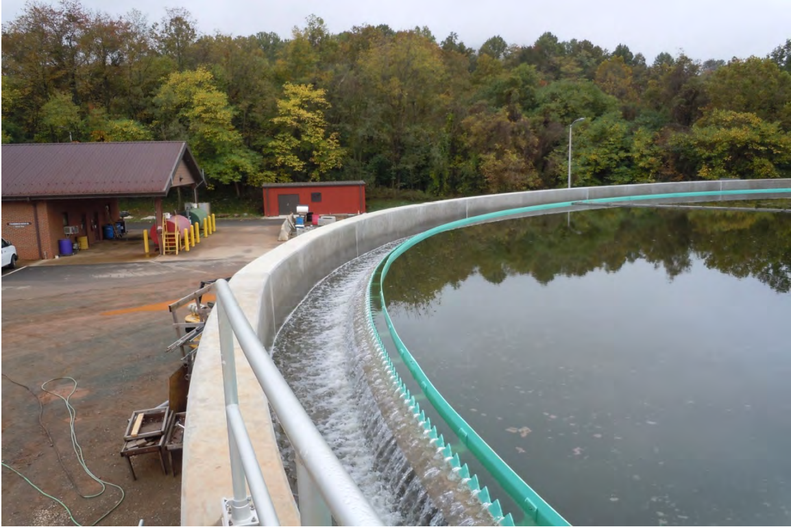
Secondary Clarifier No. 4 in Operation