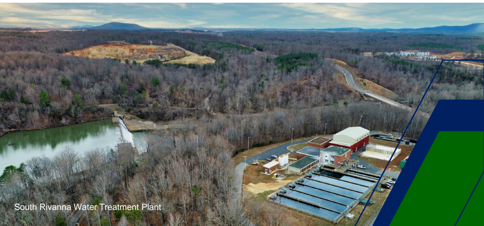
South Rivanna Water Treatment Plant