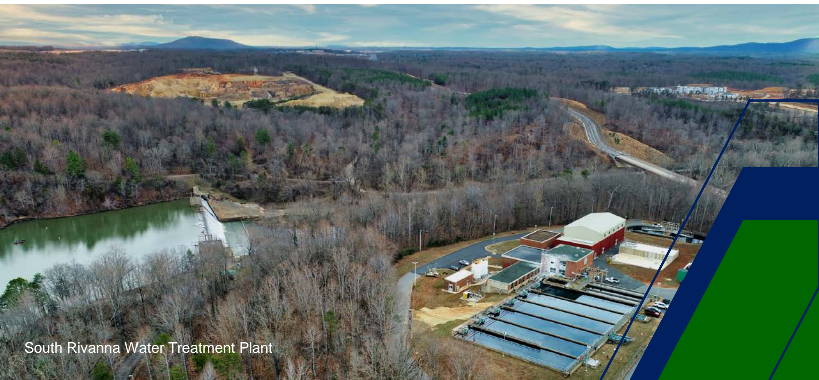
South Rivanna Water Treatment Plant