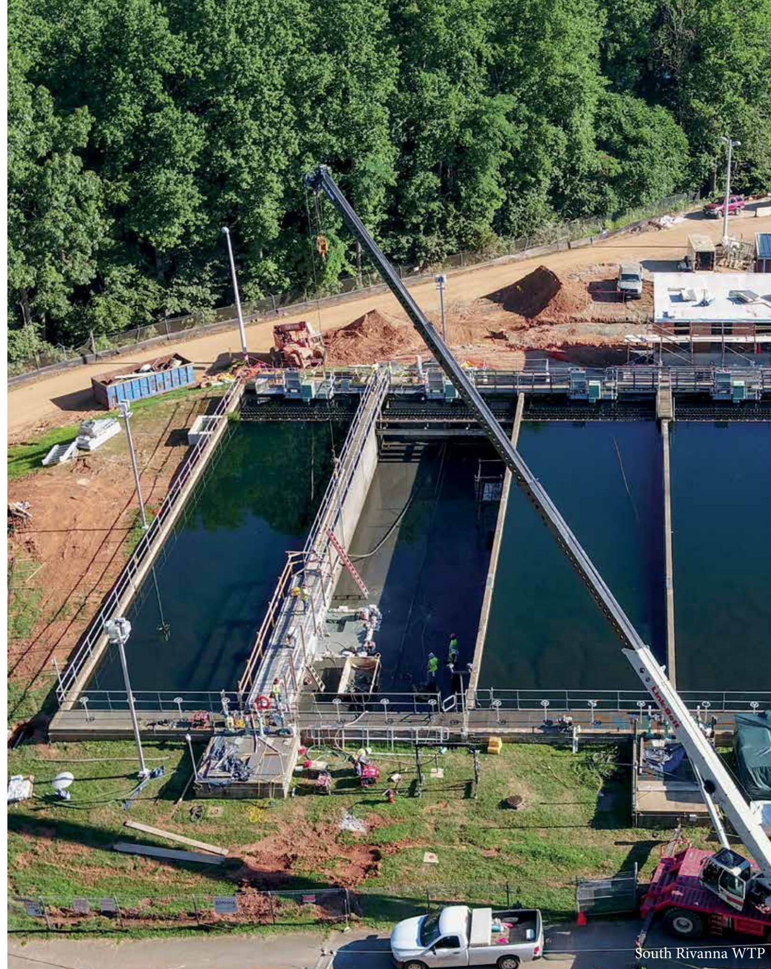
South Rivanna WTP