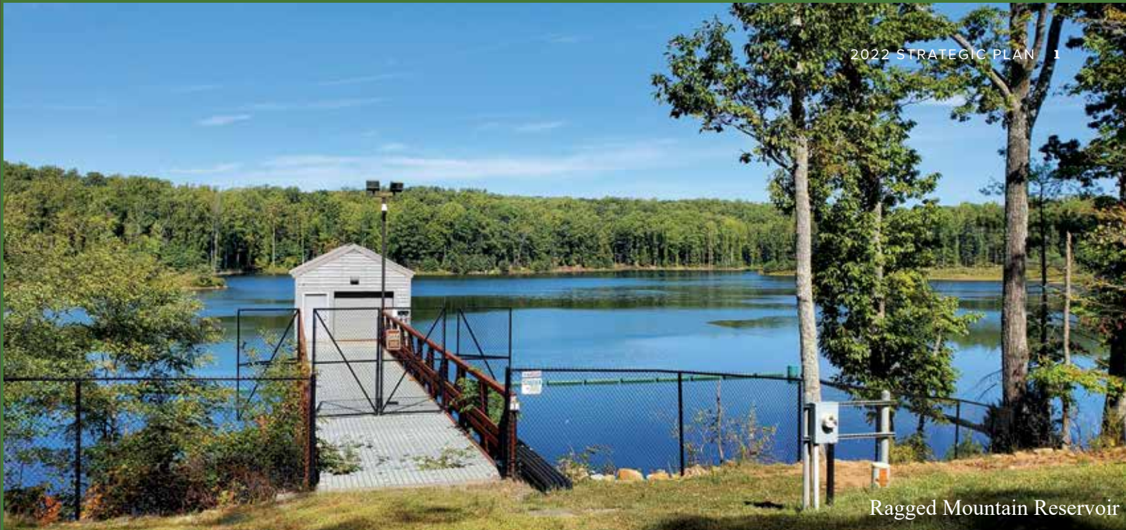
Ragged Mountain Reservoir