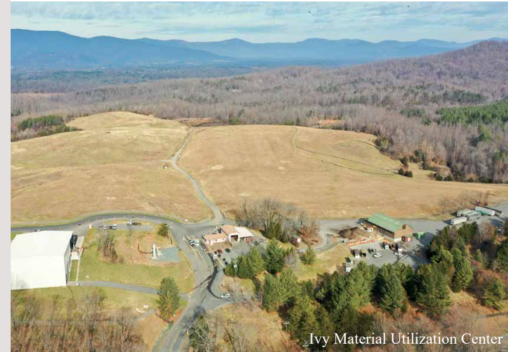
Ivy Material Utilization Center