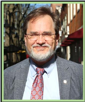
Brian Pinkston, Vice-Mayor Charlottesville City Council